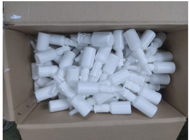
Fig. 4 Containers of PVP-I Oro-Nasal spray