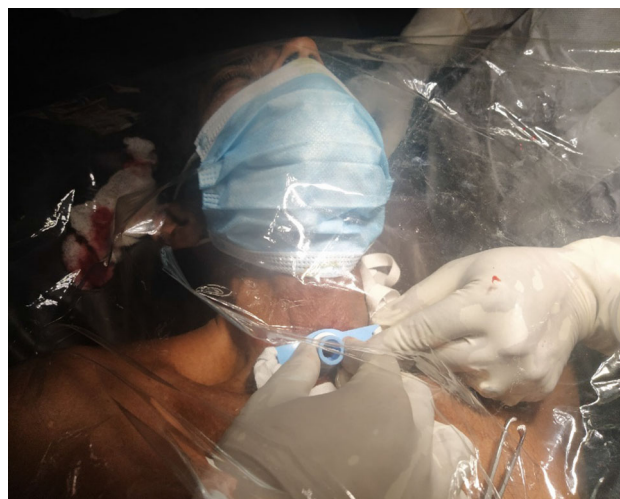
Fig. 8 During Emergency tracheostomy in COVID-19 pandemic (by 'POLIDON' approach)