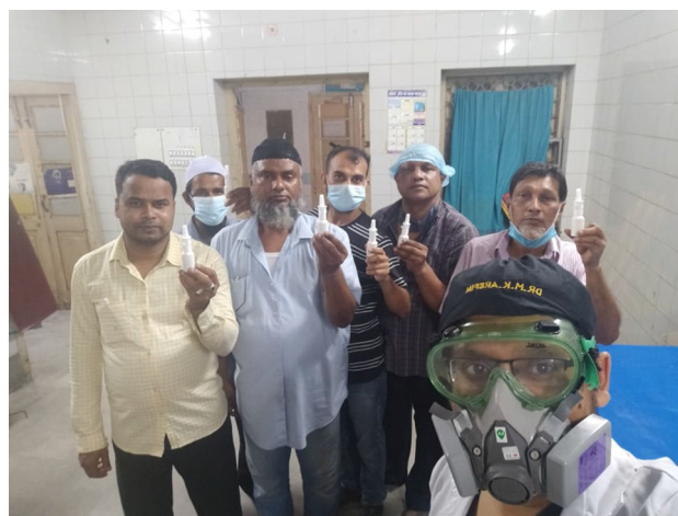
Fig. 1 HCWs of Dept. ENT & HNS, DMCH holding the PVP-I Oro-Nasal spray

I personally use it by myself in my private practice, in all of my surgery, all of the OPD procedures. Irrespective of COVID-19 status, either RT-PCR test positive or