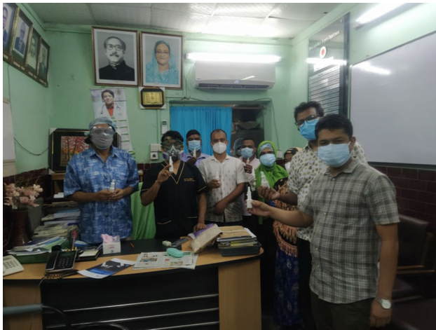
Fig. 2 Doctors and other HCWs of Dept. ENT & HNS, DMCH holding the PVP-I Oro-Nasal spray