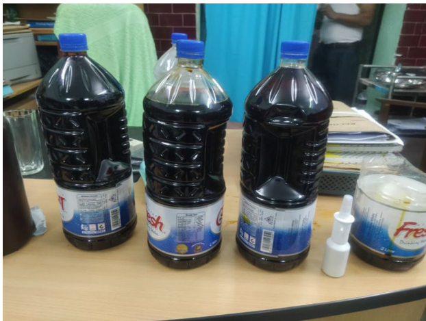
Fig. 3 PVP-I solutions prepared for gargling and Oro-nasal spray