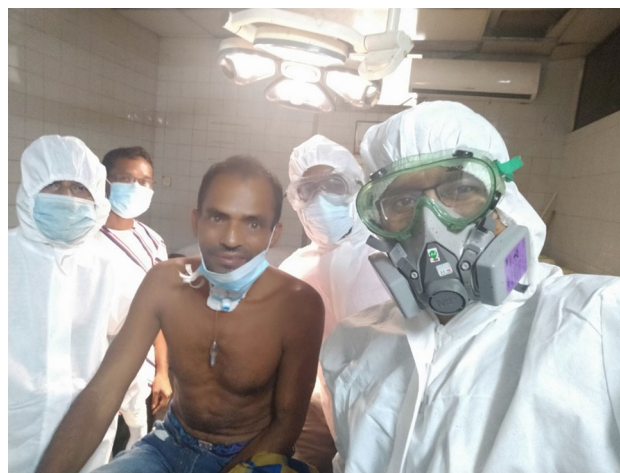
Fig. 7 Immediately after emergency tracheostomy